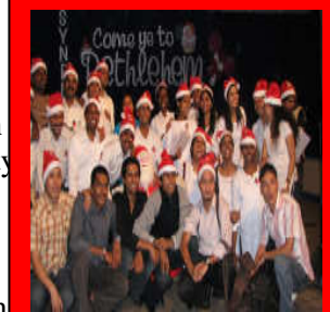
Figure out, please!

1. How privileged are we! For we rushed to see – The King of glory very first, And He quenched all our thirst! Who are we?